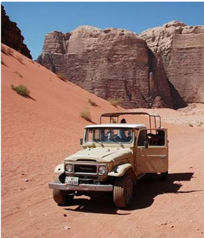
Jeep Safari in the desert