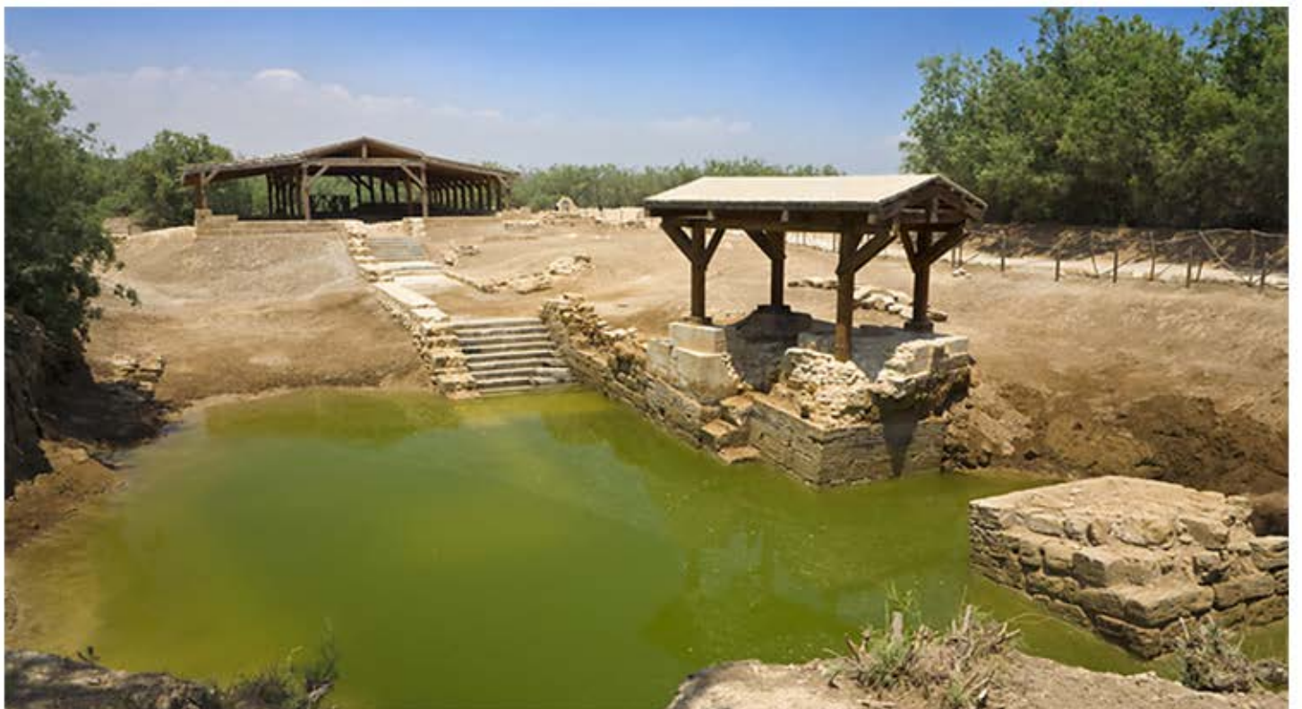
Bethany beyond the Jordan – baptism site