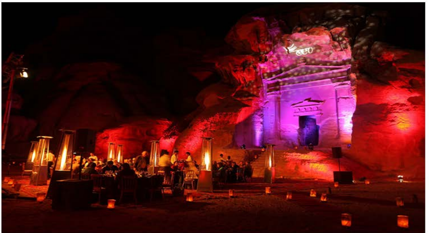
Exclusive Private Dinner