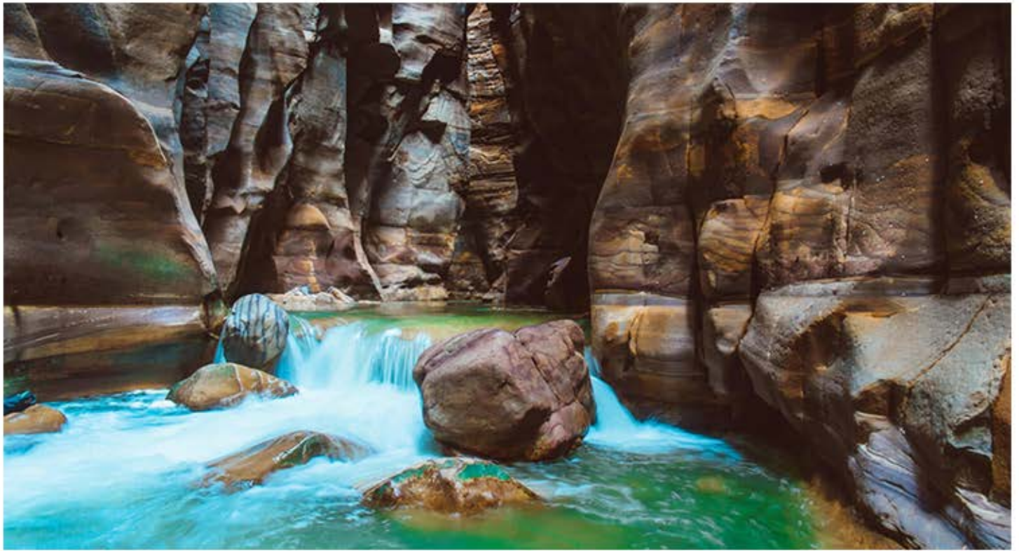
Hiking in the Mujib River