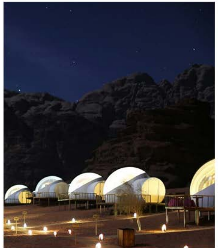
Spend the Night at the Luxury Camp