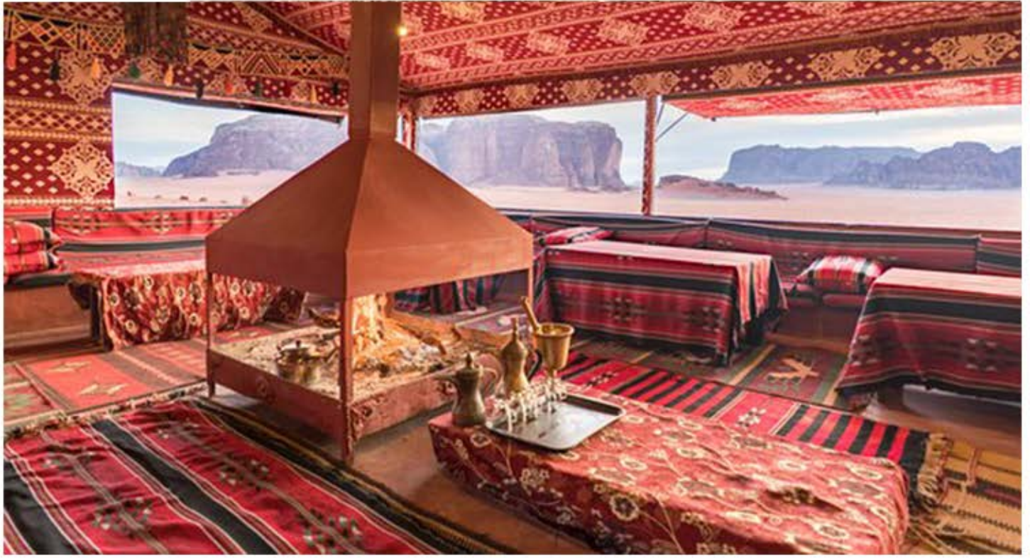
Private lunch at Bespoke Bedouin Camp