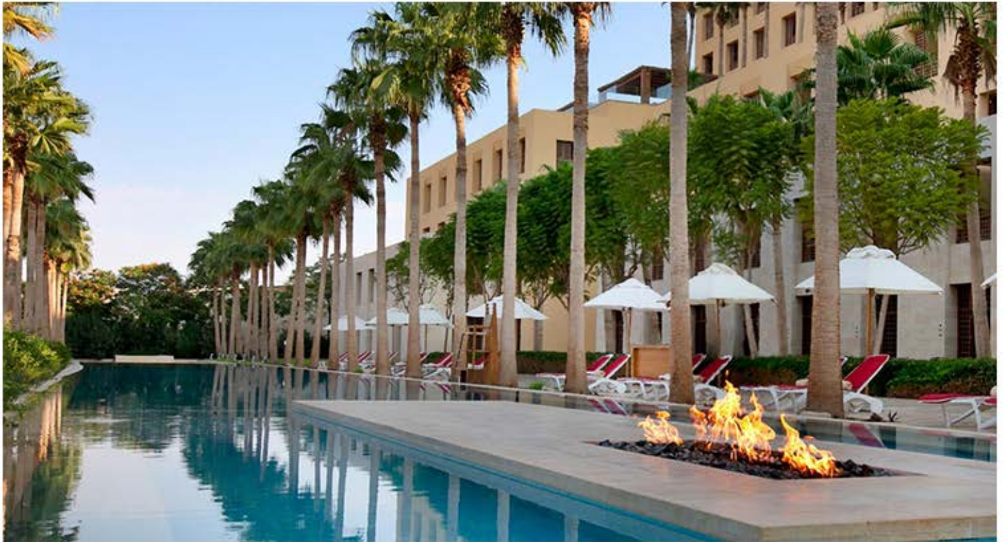
Ishtar Kempinski Dead Sea