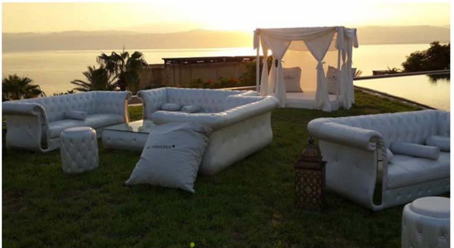
Aroma Therapy Dinner