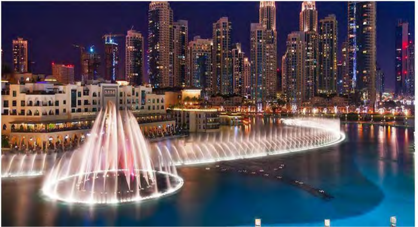
The Dubai Fountain show.