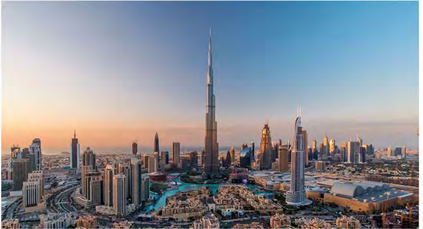
Burj Khalifa, the world's tallest building.