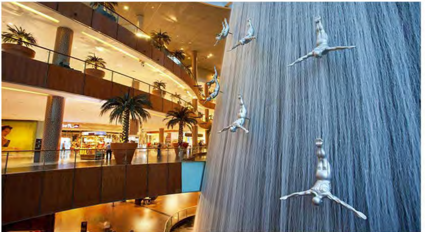
Dubai Mall, the world's largest mall.