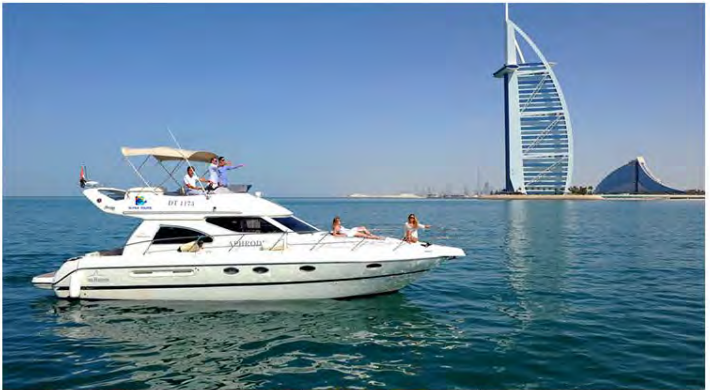
Yacht day around the Palm and World map.