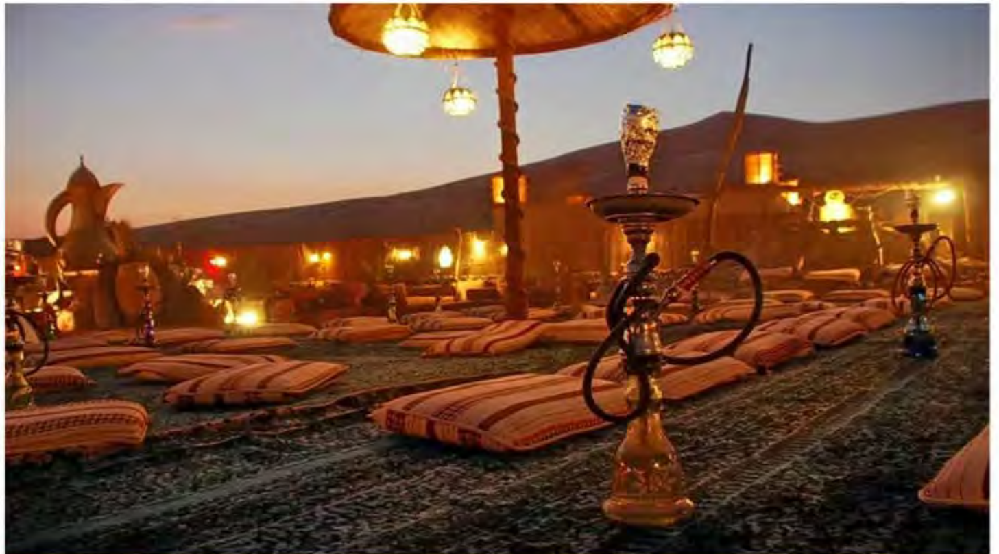
Over night desert safari.