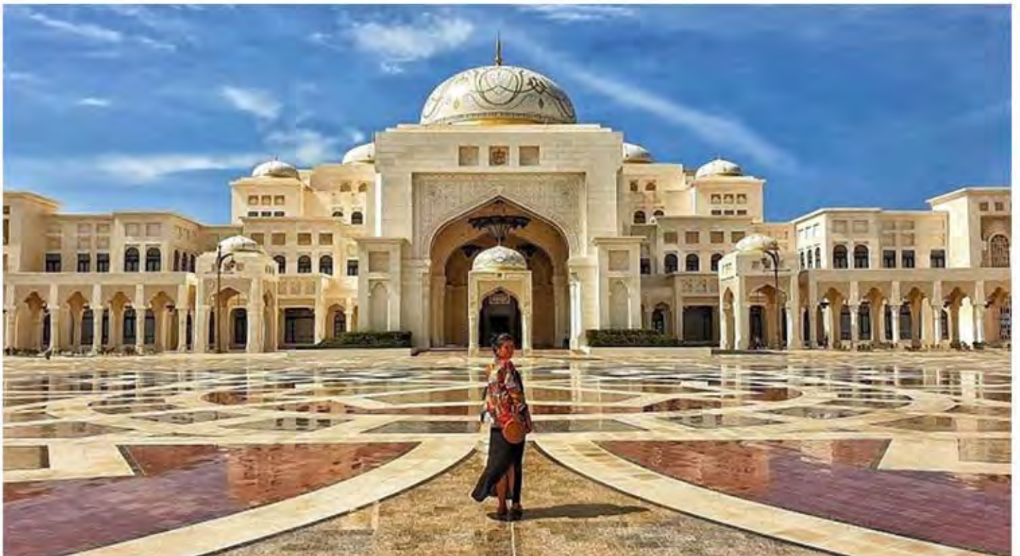
Qasr el watan.