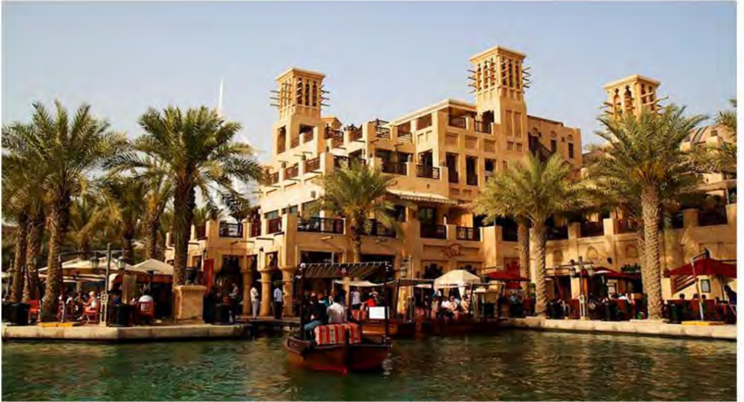
Souk Madinat Jumeirah.