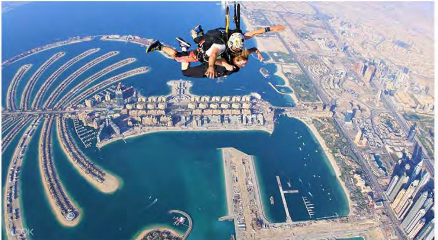
Skydive Dubai experience.