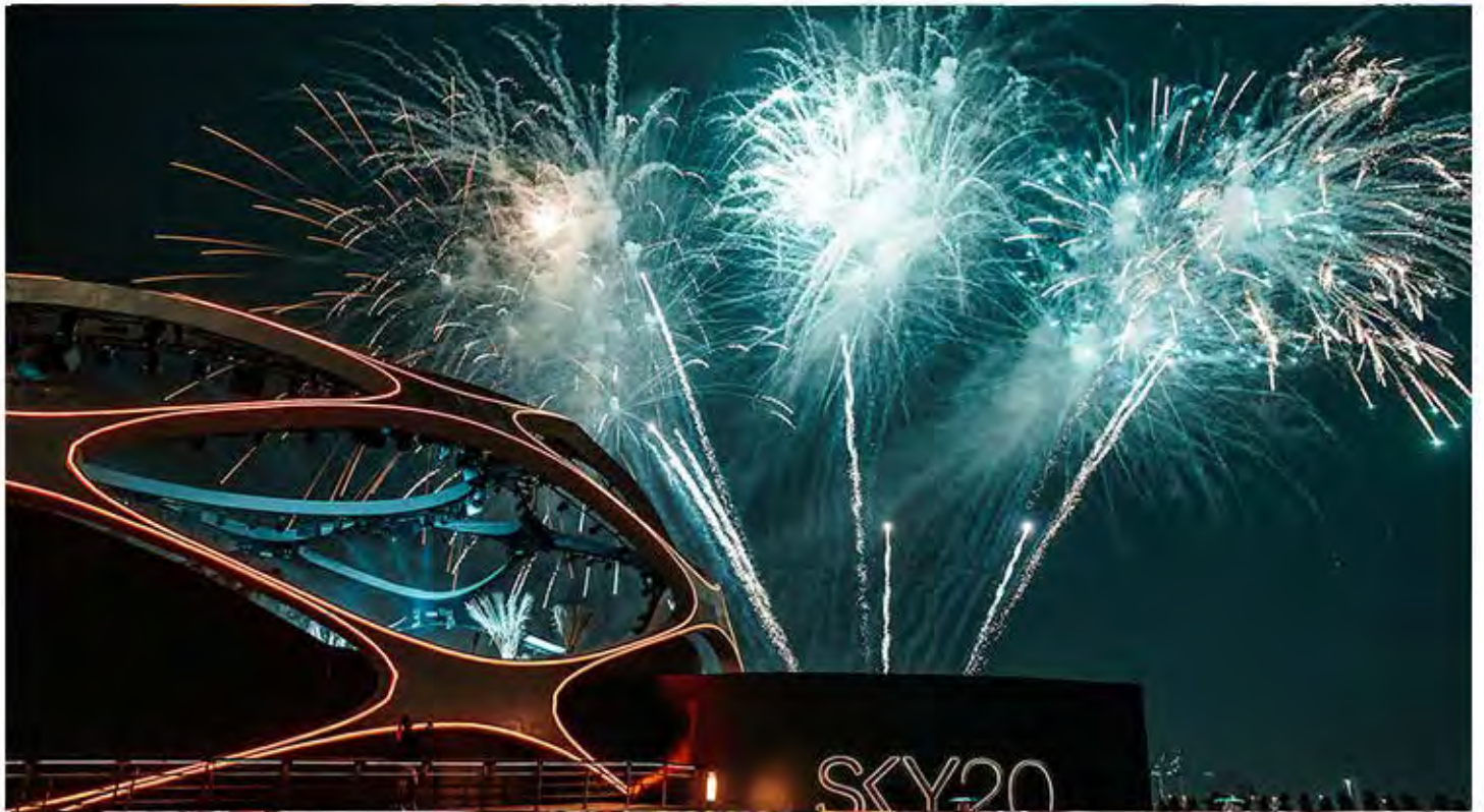
Dubai Night life.