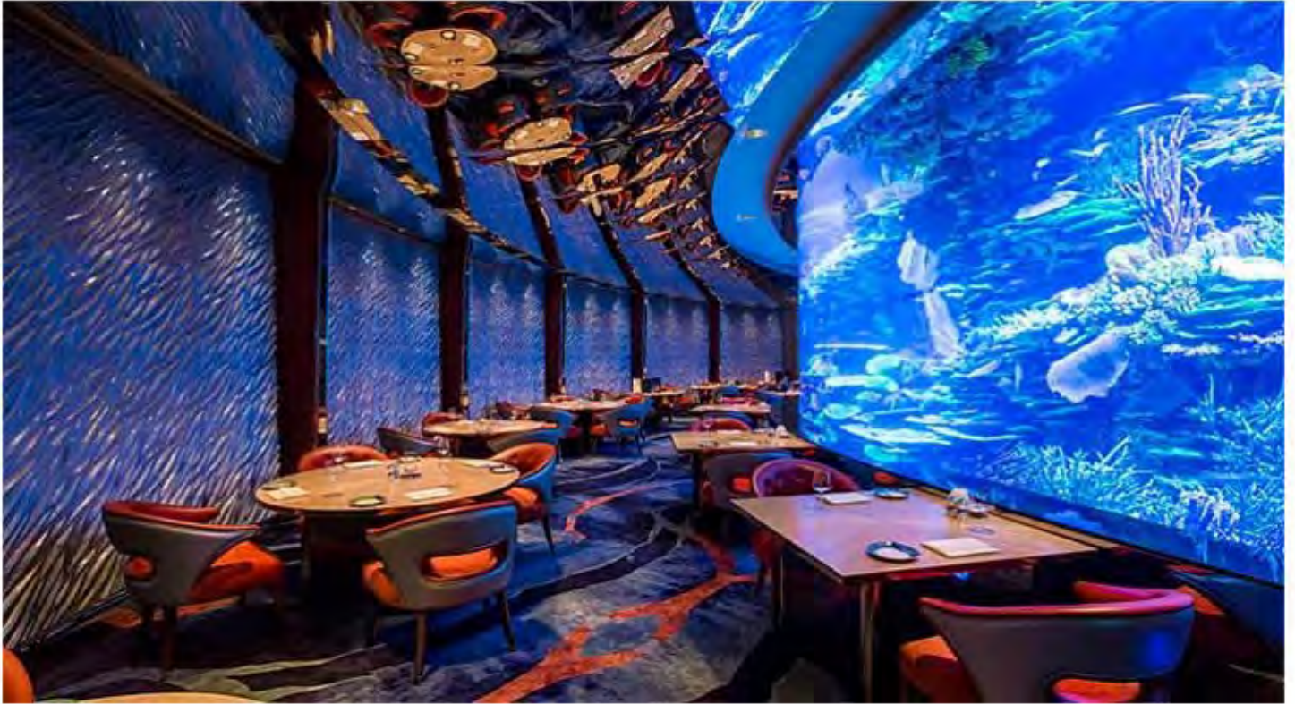
Selection of best restaurants.