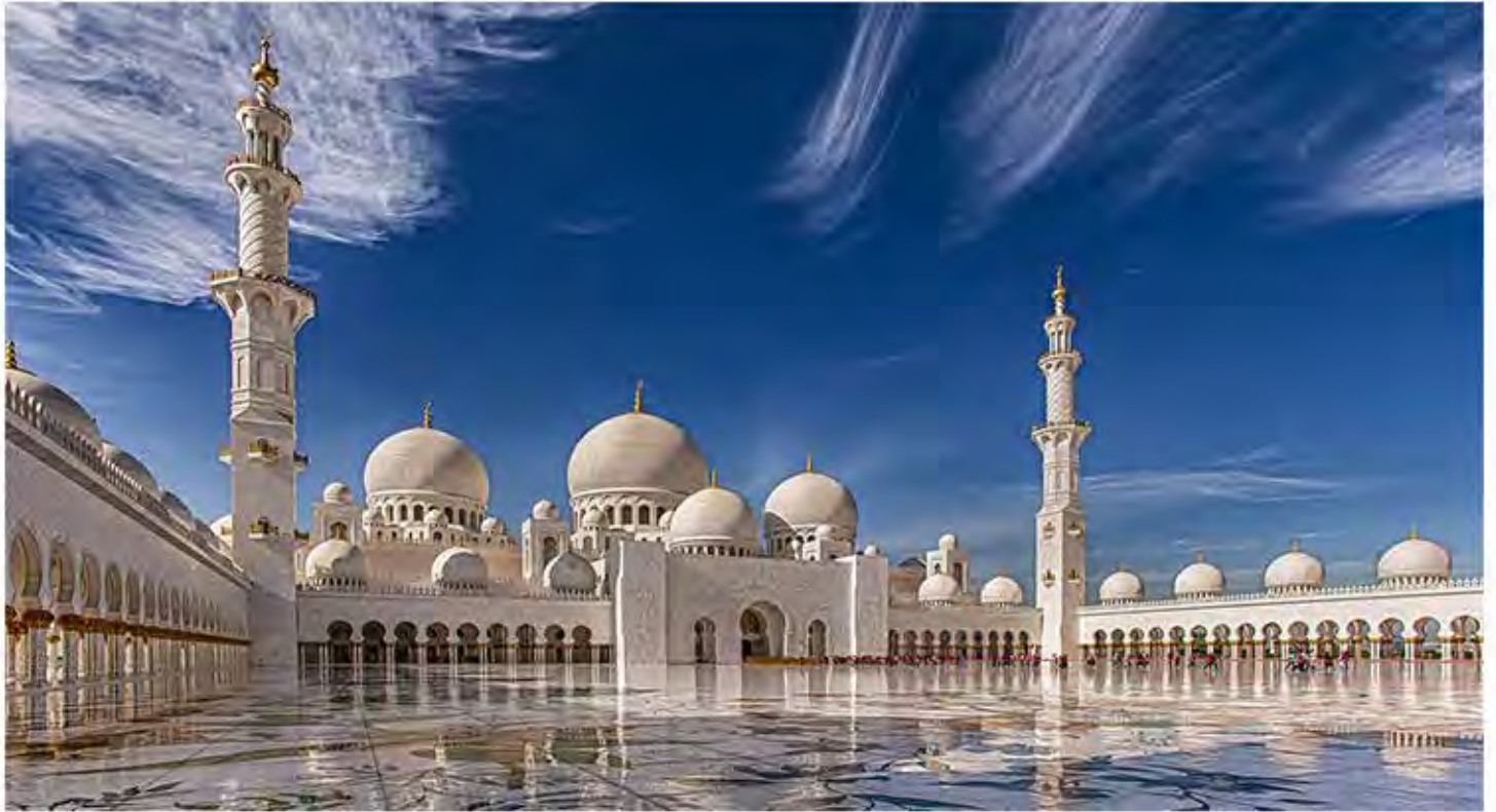
Sheikh Zayed mosque.