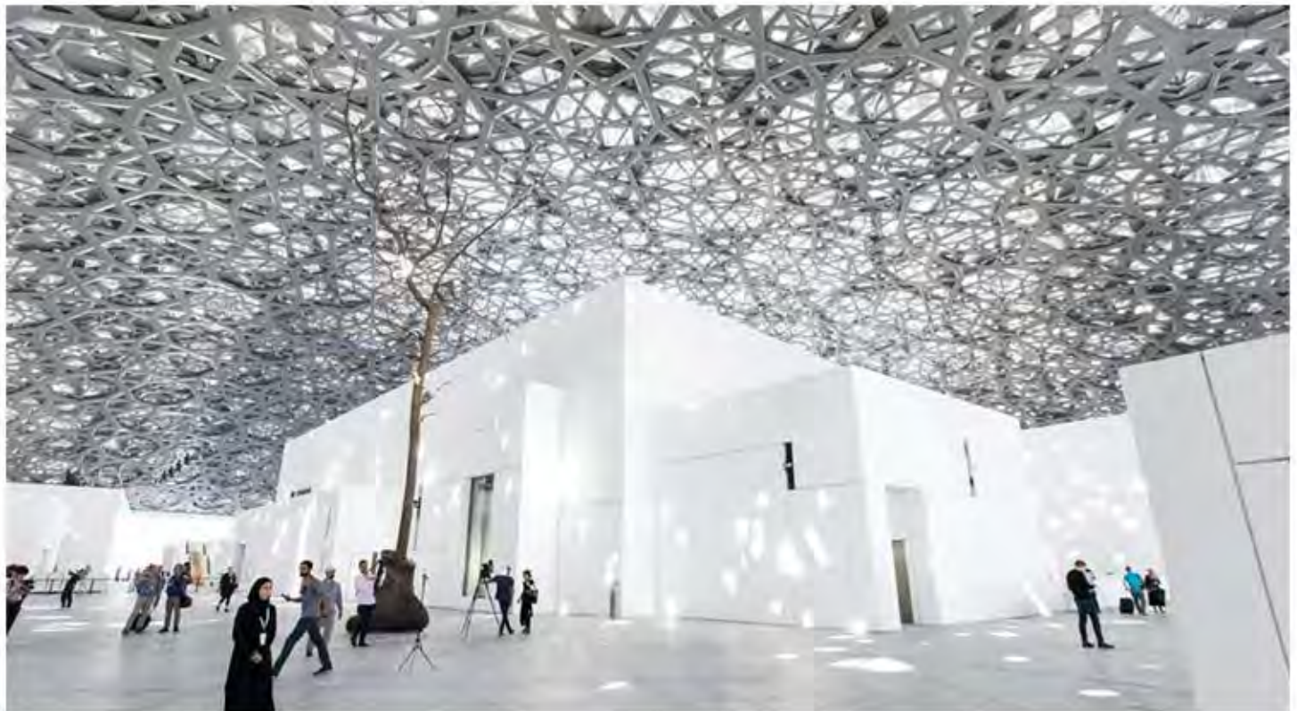
Louvre Abu Dhabi.